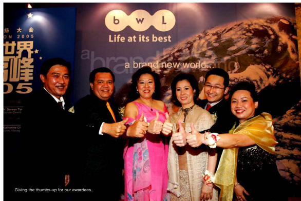
Giving the thumbs-up for our awardees.

With this historical moment, bwL (Malaysia) has entered another phase of development. We now enjoy a bigger space for our distributors' activities and gatherings, a cosier and more comfortable environment for our customers, a state-of-the-art auditorium for training and learning and last but not the least, increase in manpower to support and provide personalized services to our distributors. Growing faster than before, bwL is set to become a household name in Malaysia soon. ●●