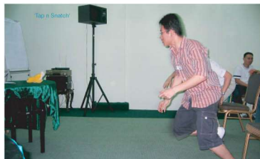
Tap a Snatch