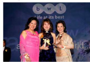
Our Malaysian Winners

The Malaysian bwL Regional Recognition Rally 2005 was a successful event motivating our distributors to strive harder and also fostering a close bond among us. ●●