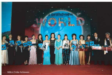
Million Dollar Achievers